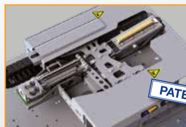
New compact welding clamp