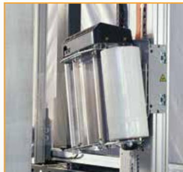
External Top Cover Units (optional)